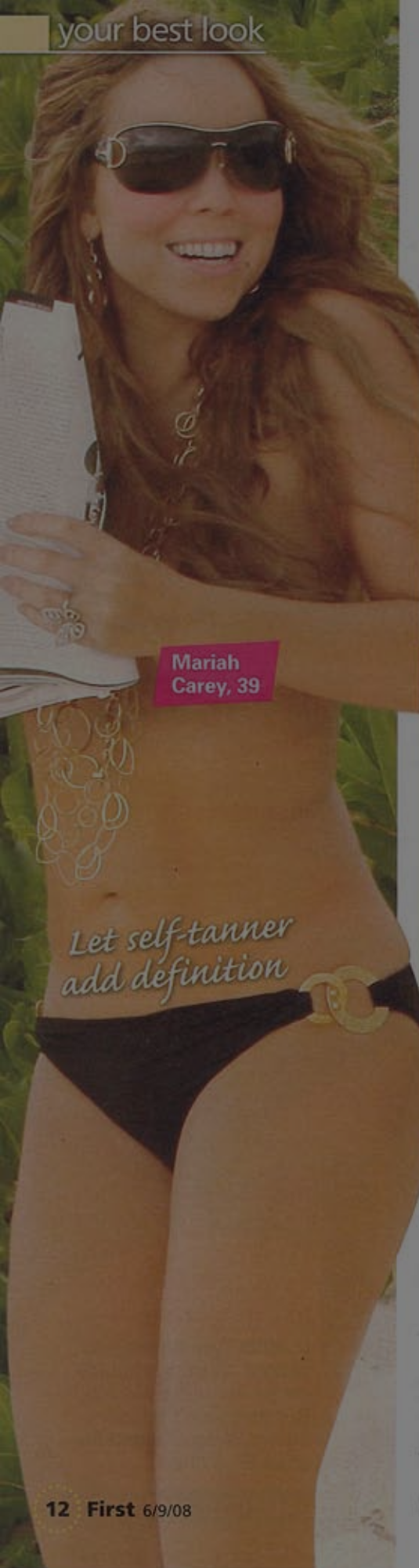
Mariah Carey, 39