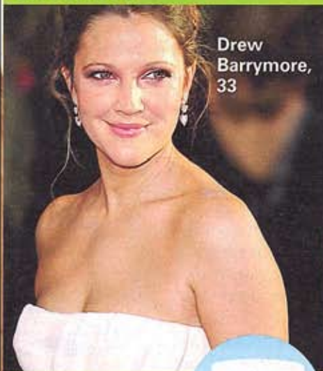
Drew Barrymore, 33